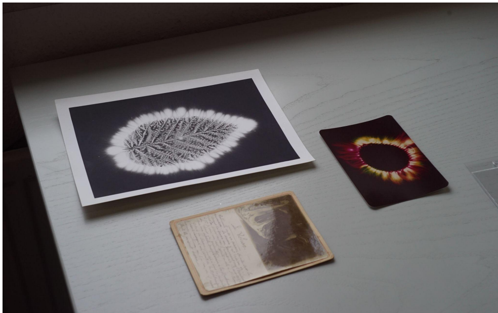
Líneas de poder ***///*** Power lines