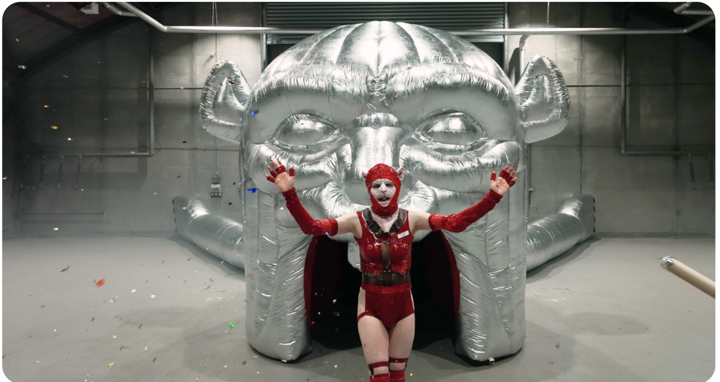
Film Still, Surrender, Jenkin van Zyl, 2023, Courtesy of the artist and Edel Assanti

Dissecting the hyperbolic, sensational, and often anxiety-inducing images and narratives that are generated on our screens, this is perfect, perfect, perfect grinds on the seamless smooth shiny surface, cracking it open – with a smile – to reveal the operations and logics of content and their never-ending toxicity at work. The festival's main exhibition brings together 13 artists and takes place at Kunstraum Kreuzberg/Bethanien.