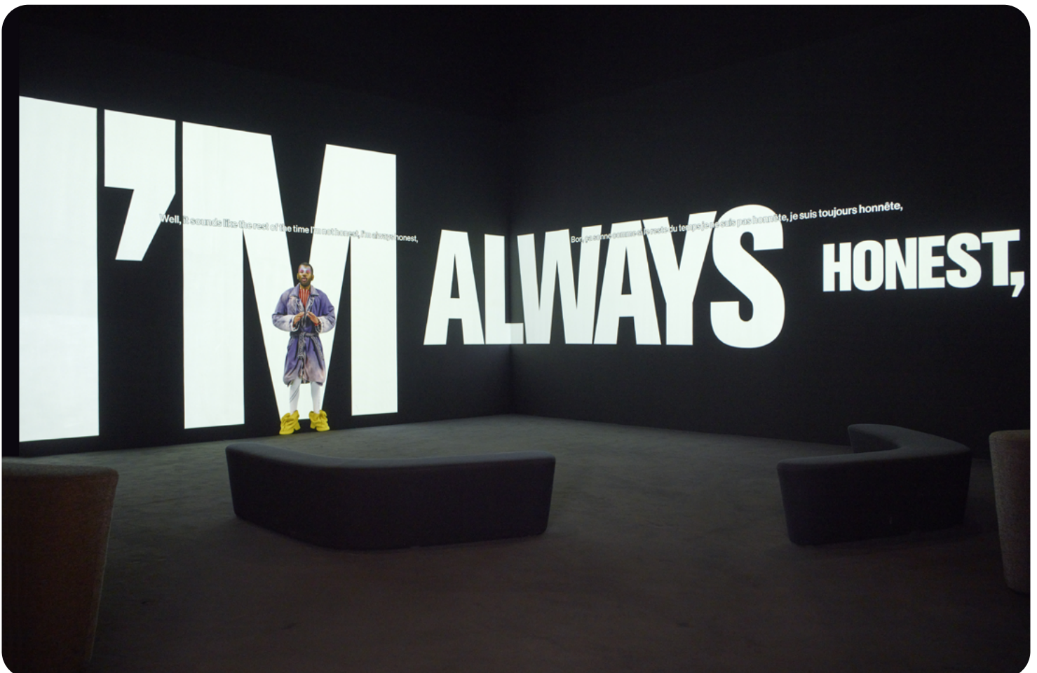
Installation View, The Guru , Ndayé Kouagou, 2023, Courtesy of the artist and Fondation Louis Vuitton, Photography © Marc Damage